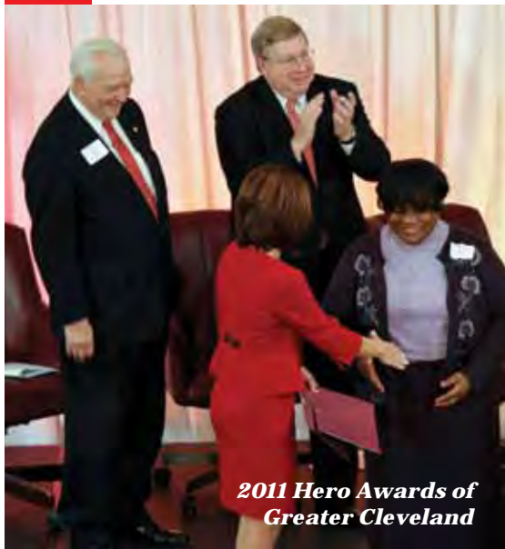
2011 Hero Awards of Greater Cleveland